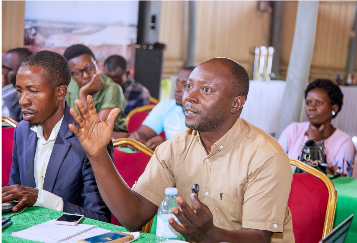
Stakeholders during the launch event in Kasese

FCA Uganda, in partnership with Prospect Initiative and with funding from the Ministry for Foreign Affairs of Finland, launched a Peacebuilding and Climate Action project in April 2026 to address the intersection of climate change and conflict in Uganda.