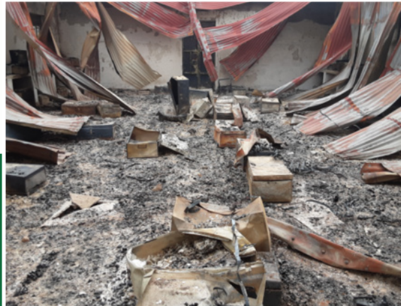
Inside the burnt dormitory at Ntenungi Secondary School, where students' belongings and study materials were reduced to ashes

Beyond the physical damage, the incident has caused significant psychosocial distress among learners, with many experiencing trauma following the sudden loss of their living space and possessions.