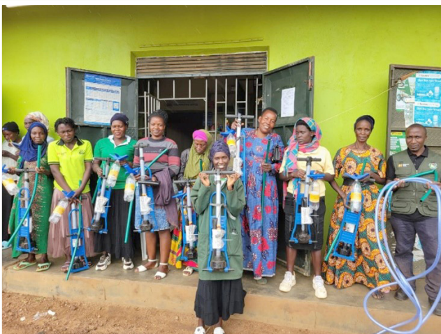
Farmers receive irrigation pumps in Mityana.

O n 24 March 2026, in partnership with KickStart International, FCA Uganda handed over irrigation pumps to women under the contract farming project in Mityana.